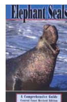
Book Price: $9.00

The following items are available for purchase from our Gift Shop. Prices include tax. Call 805-924-1628 for shipping and handling costs.