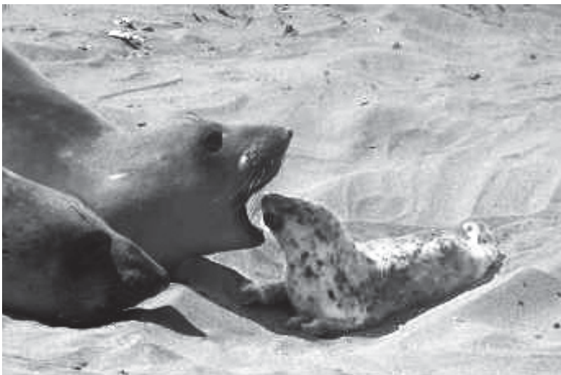
This harbor seal pup was rescued from the rookery by the Marine Mammal Center, treated and released.

As November approaches, the subadult males will begin to return to the beach to haul out and rest until the huge adult males begin to arrive again, a sign that the excitement of the birthing and breeding season is right around the corner.